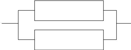
Figure 2: Backup with passive redundancy

Define the possible system states and the probabilities for these states. One device is faulted with intensity, \lambda , and the fault is fixed with intensity, \mu .